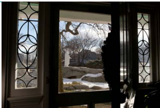
A view from inside the front door of the Retreat Center